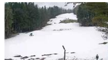
Webcam view from Holiday Valley Lodge Tues. Dec 5

A couple of points to be noted are: First, if you pre-register and are a member of Hi Rise your race registration fee is covered by the club. If you do not pre-register, you must pay the $25 fee yourself and you will not be reimbursed by Hi Rise. Second, work assignments for race days will be made. If a racer fails to complete his/her assigned task, your race for that day will be considered a DQ. BTW, only one third of all racers are assigned tasks at the day's race. To learn more, see the Hi Rise Racer News on page 8.