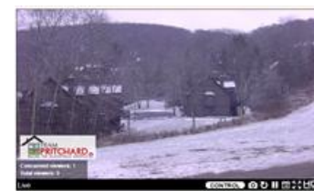
Holimont webcam Tues., Dec. 5