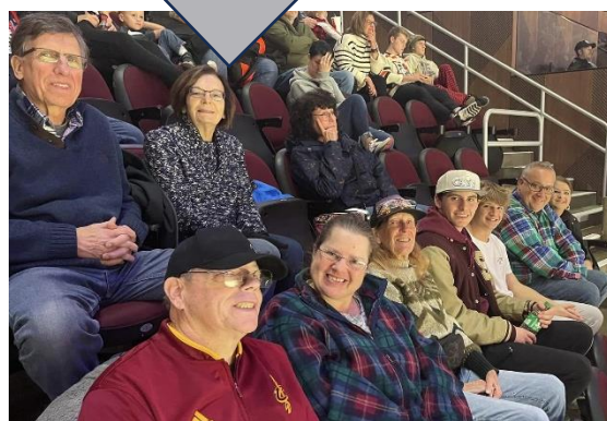
Hi Risers enjoying a night out at the