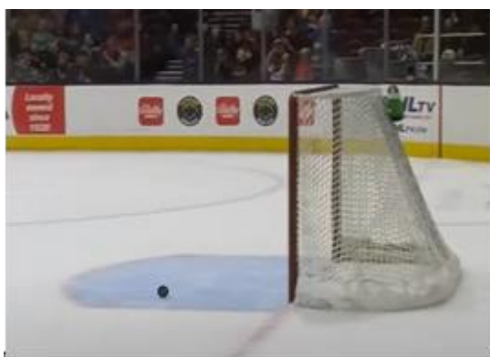
The fourth goal for the Monsters at the unattended Comets goal.