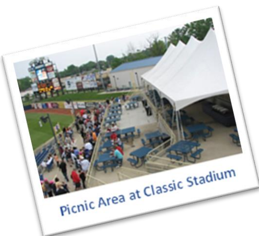
Picnic Area at Classic Stadium

Please include this form with your check.