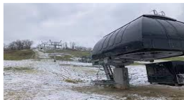
The New Buena Vista quad lift at Boston Mills.