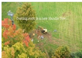
The handle Tow installation at Alpine Valley

Vail Resorts has also been working to increase hours at all of the Ohio areas in response to comments from Ohio skiers last year. With some good snow this season, we should have