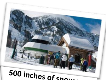
500 inches of snow per year! Snowbasin