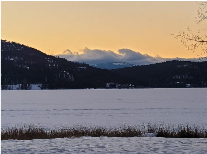
Looking across Lake Whitefish from condos