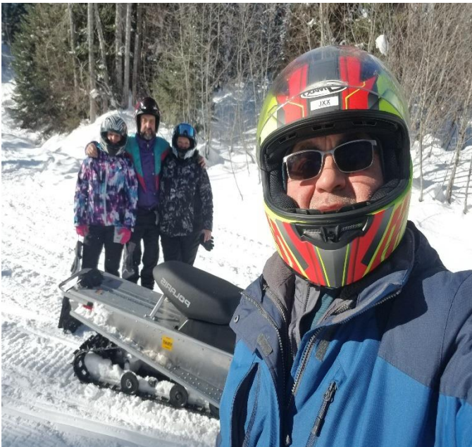
Snowmobiling in Whitefish

All Around Town books are in and will be available at all meetings and events