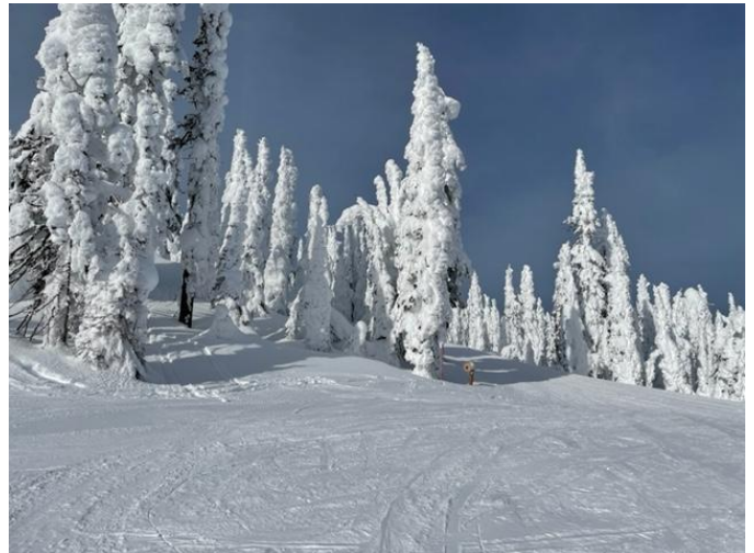
The ghosts of Whitefish

Whitefish article will appear in March's newsletter