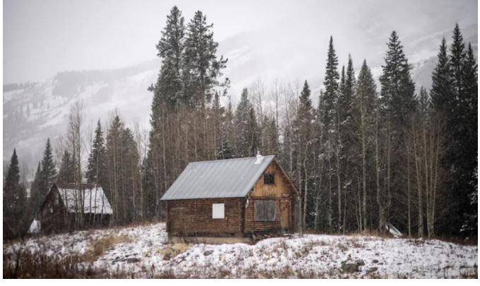
Colorado Snowpack changes https://www.washingtonpost.co m/nation/2021/11/27/coloradorockies-snow-climate-lab/