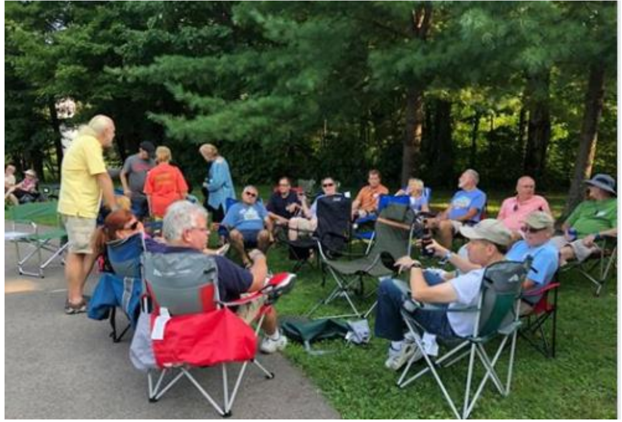
Circle of friends...enjoying a summer picnic, drinking adult beverages and catching up!