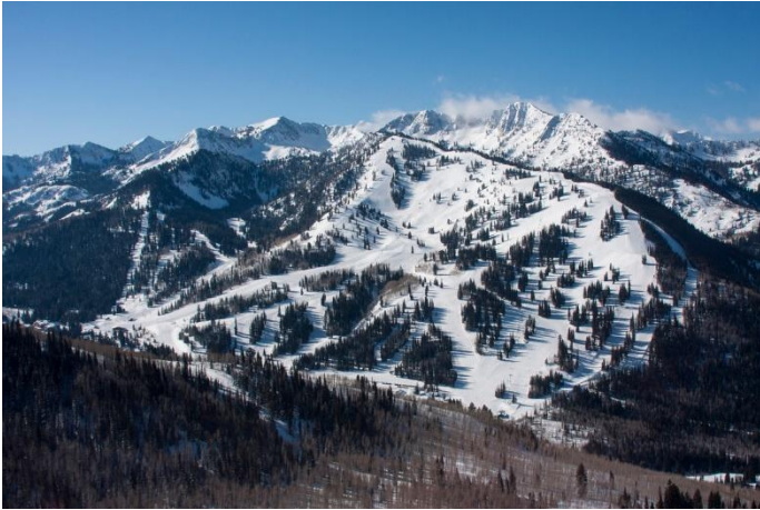
Solitude Mountain Resort

Alterra Mountain Company announced today that it will acquire Solitude Mountain Resort in Utah. Solitude will be the 13th ski resort purchased by the recently formed Alterra Mountain Co., and the 26th resort added to the company's Ikon Pass. Solitude will join a portfolio that includes Deer Valley , Mammoth Mountain , Steamboat , and others.