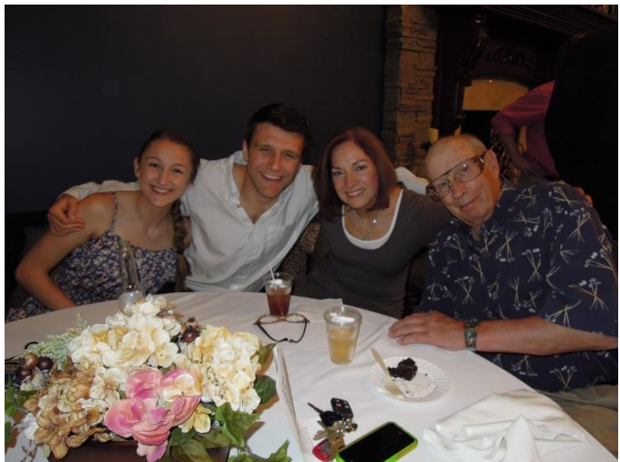
...nice to see some people from the weeklong western trip at the banquet!