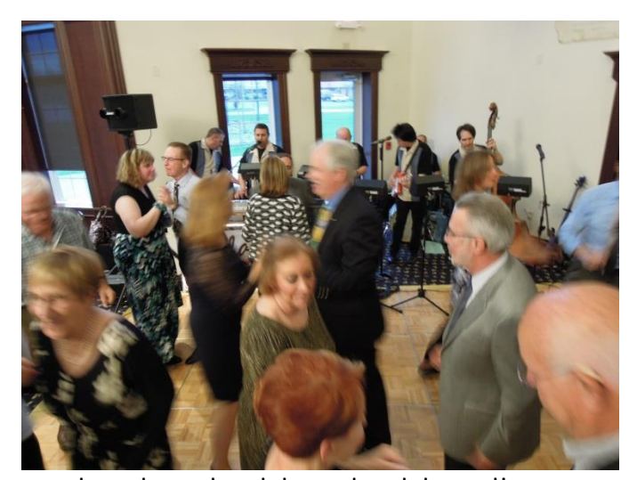
...and we danced and danced!