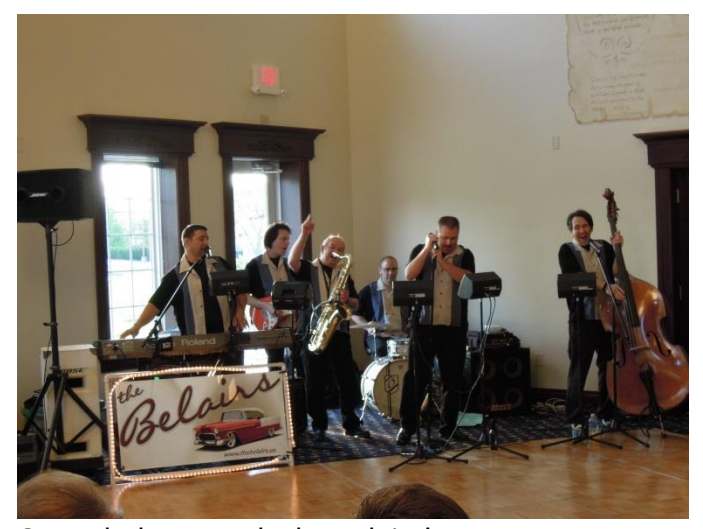
Our Fabulous Band, The Belairs!