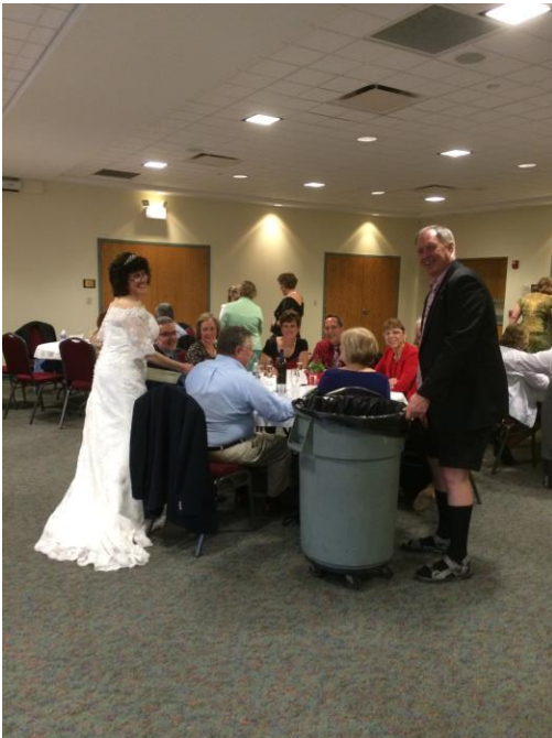
What bride and groom wouldn’t bus their guests tables?