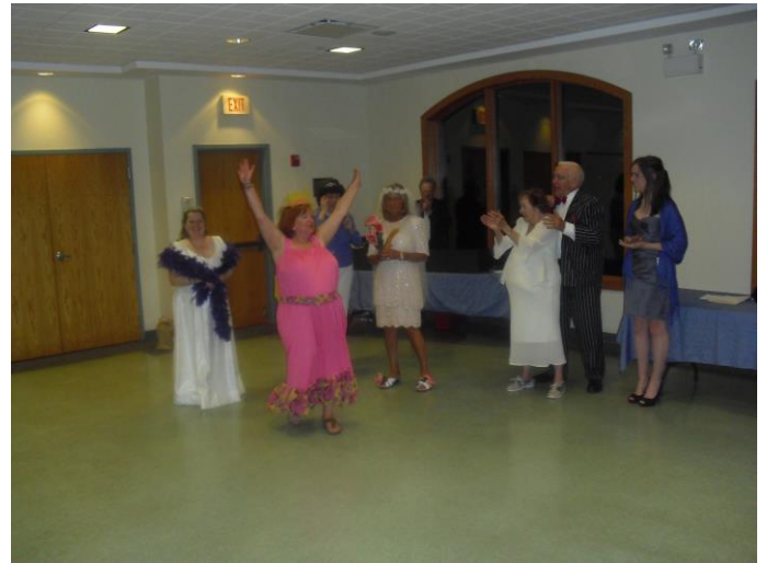
Wedding attire contestants flaunt their stuff!